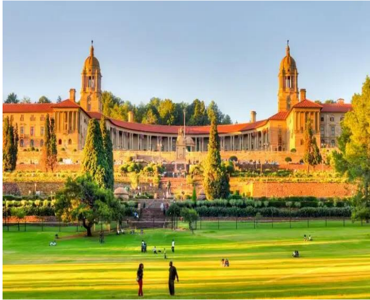
←The Union Building→