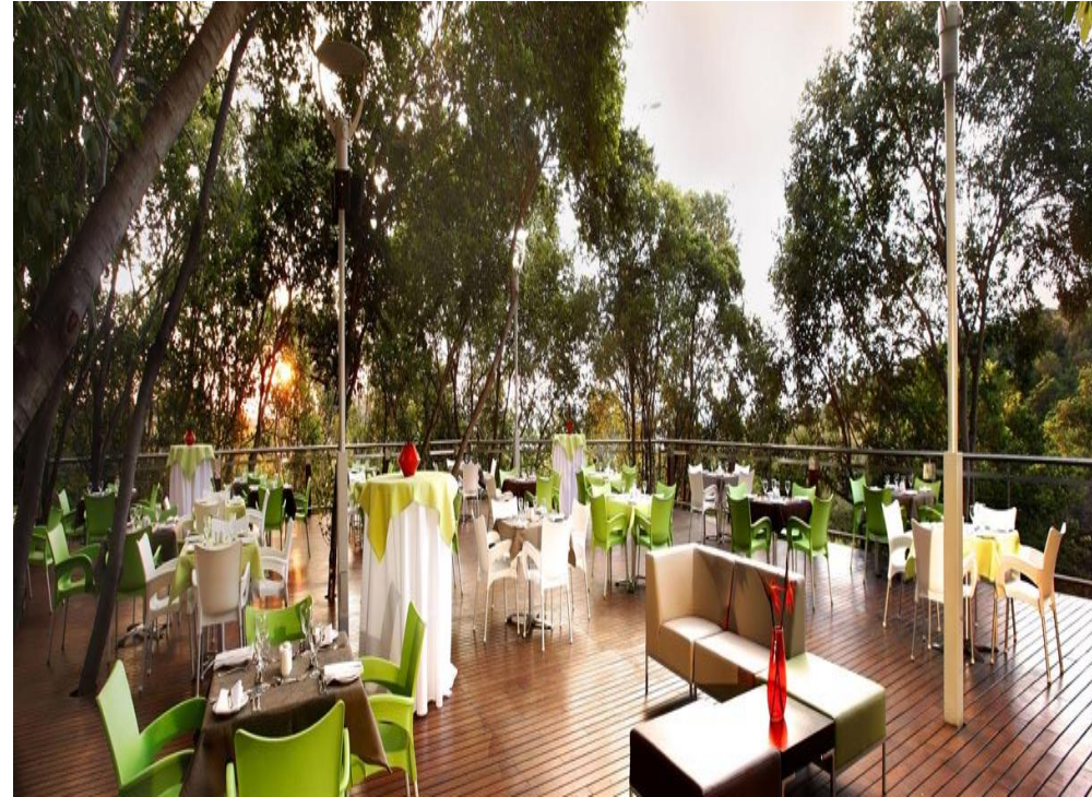
Conference cocktail and networking